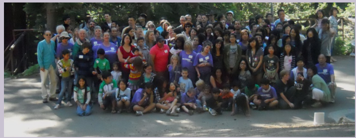
Silica Bible Chapel Family Camp—July 2011 The largest group to use our newly remodeled cabin area

We thank our supporters for their prayers and financial support. We could not continue to function without our faithful “Partners.” Our “Partners” through their prayer, service and support enable our mission to create an atmosphere where campers can retreat, develop their personal relationship with Christ, and grow in relationship to each other a reality. We have had several campers tell us in the last year that in all their years of retreats their experience at Sierra Pines has been their best. As a couple of university students put it last weekend, “I have felt loved and nurtured during my stay” and “the staff has seemed to anticipate our every need.”